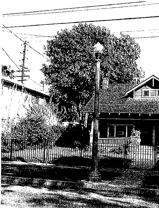
For the Heritage Square Historic District, TRC will confirm that the "designated replacement streetlight consists of a Corsican style Marbelite pole with an acorn style fixture, which is both energy/lighting efficient and in character with the Heritage Square area."

While not all of the 3,500 ornamental streetlight sites within City limits can be reviewed, we will consider whether or not the proposed lights are appropriate for each existing and potential Historic District (17) and Neighborhood Conservation Area (8) within the City.