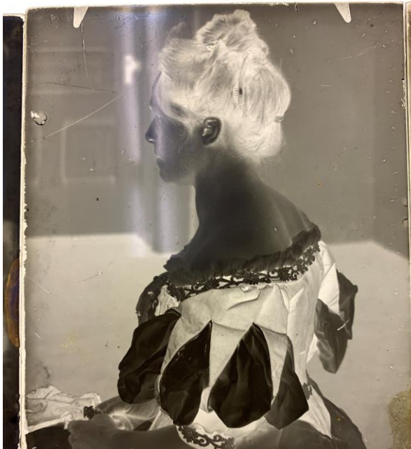
Unidentified woman dressed in 1890s fashion.