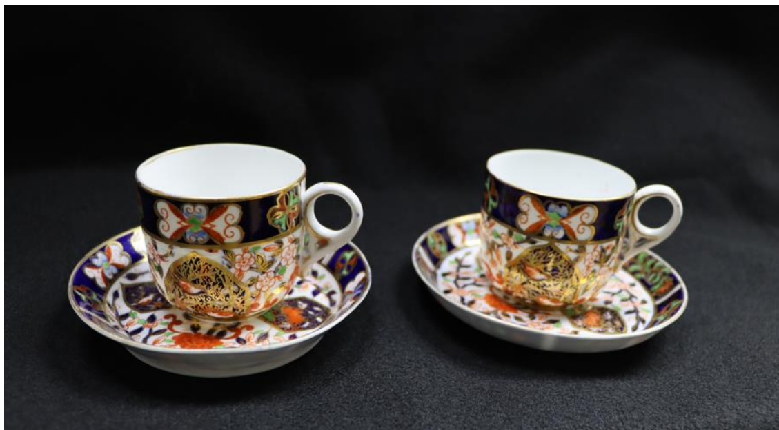
Victorian-era Royal Crown Derby manufactured teacups and saucers

"Heritage House lacks most of its original furnishings and, thus, is operated as a stately home representative of the 1890s way of life of Riverside's affluent citrus-growing community, rather than reflective of a specific family."