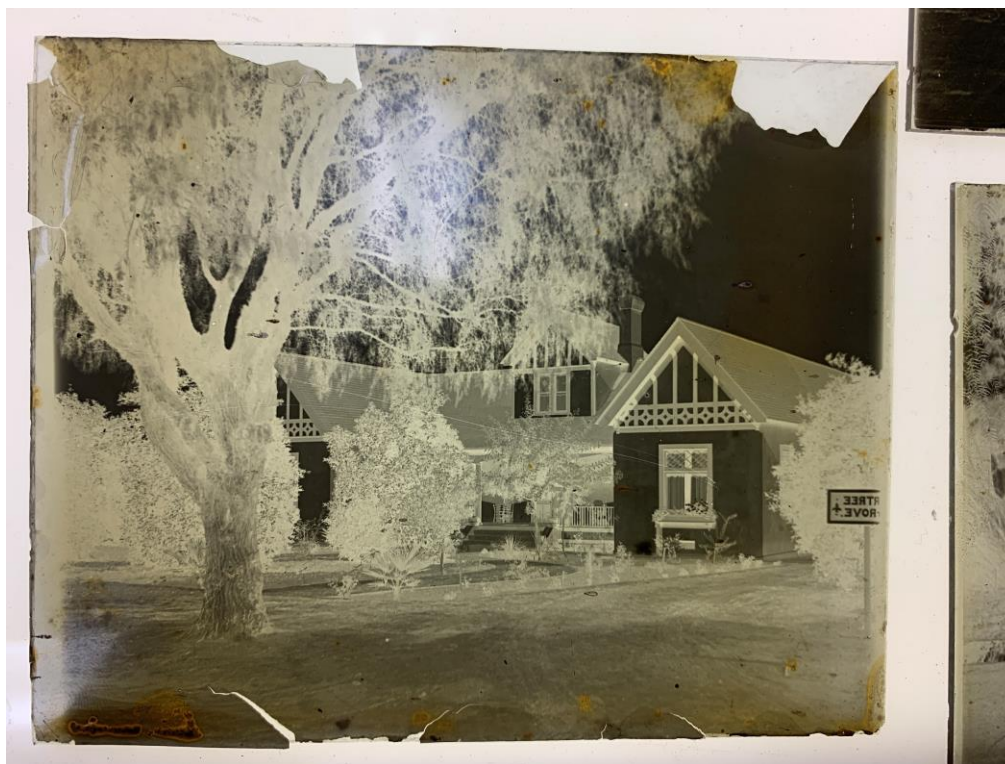
Hartree Grove on Victoria Avenue

Images below are a representative sampling of the forty-two (42) negatives.