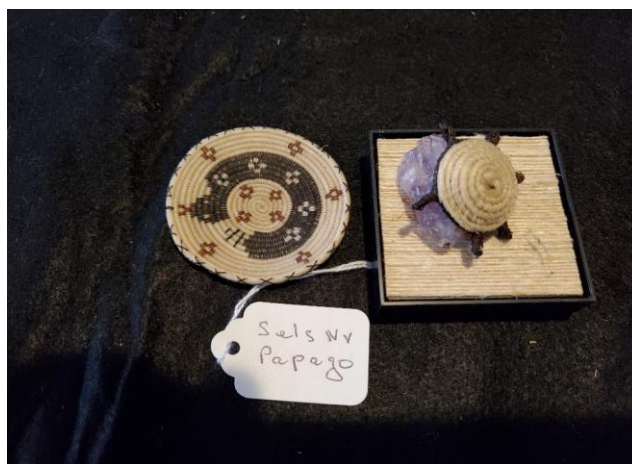
Tohono O'odham (left); SW Apache (right)