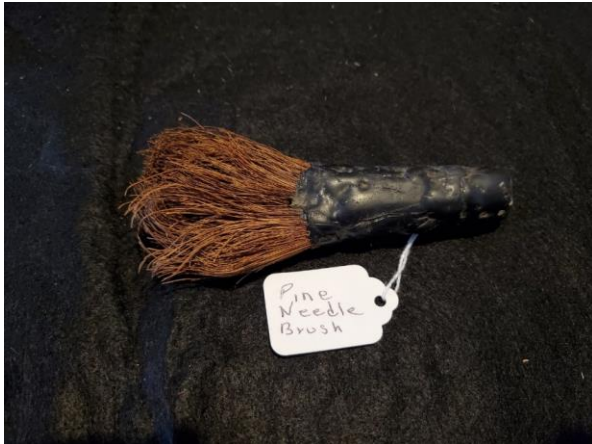
Pine Needle Brush