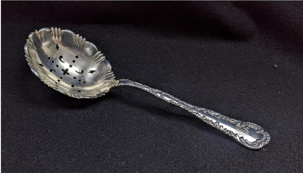
Wood Hughes Louis XV hallmark sterling silver sugar sifter.