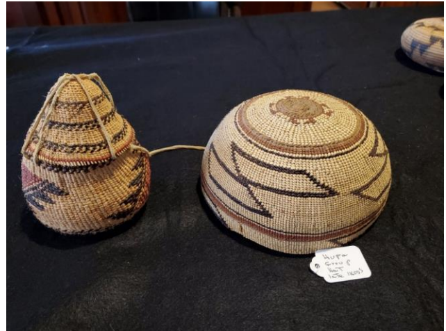
Woven Basket from Hoop Valley