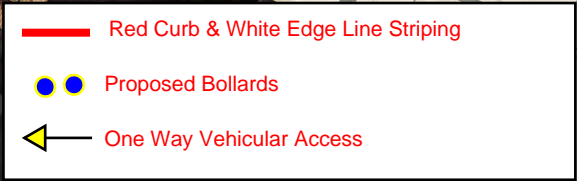
SD-2022-00011 (Street Vacation): Exhibit 7 - Site Plan