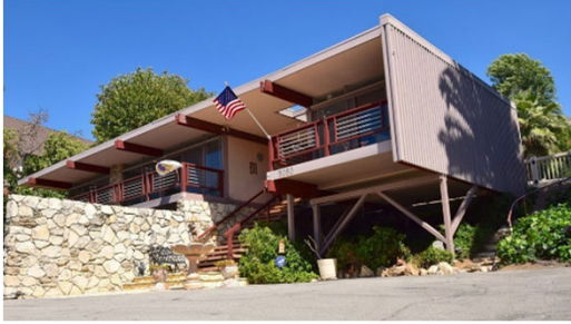
North and West Elevations