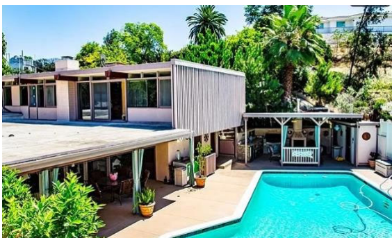
North elevation of third story & Pool Deck