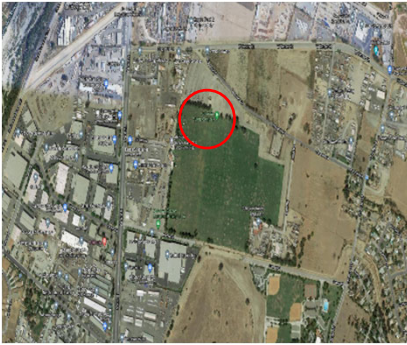
Ab Brown Sports Complex