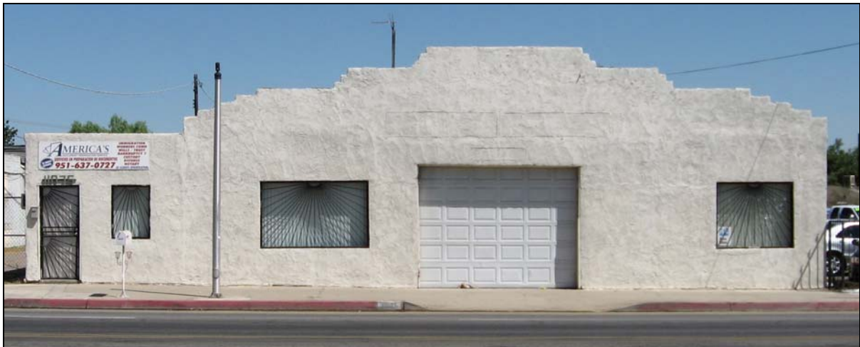
Figure 29. 11075 Hole Avenue, view to the north (2007).