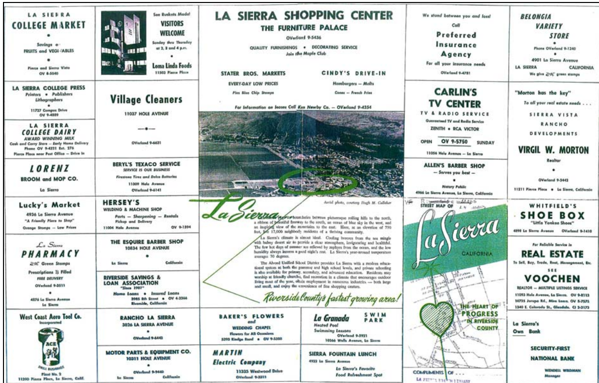
Figure 27. Promotional sheet for La Sierra and its businesses, circa 1960

In 1964, the La Sierra area, including the survey area, was annexed into the City of Riverside. According to a City plan prepared at that time, in the Arlanza/La Sierra area, there were approximately 275 acres of commercial development with another 340 acres of planned commercial development ( Riverside Press 1964). By 1967, it appears that most of the buildings in the survey area at the Five Points intersection had been constructed (previously referenced Figure 26; Aerial Photograph 1967).