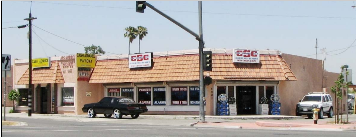
Figure 28. 5901–03 La Sierra Avenue, view to the northeast (2007).

The majority of the commercial buildings in the survey area lack architectural detail and are not good representations of a particular style (Figures 28 and 29).