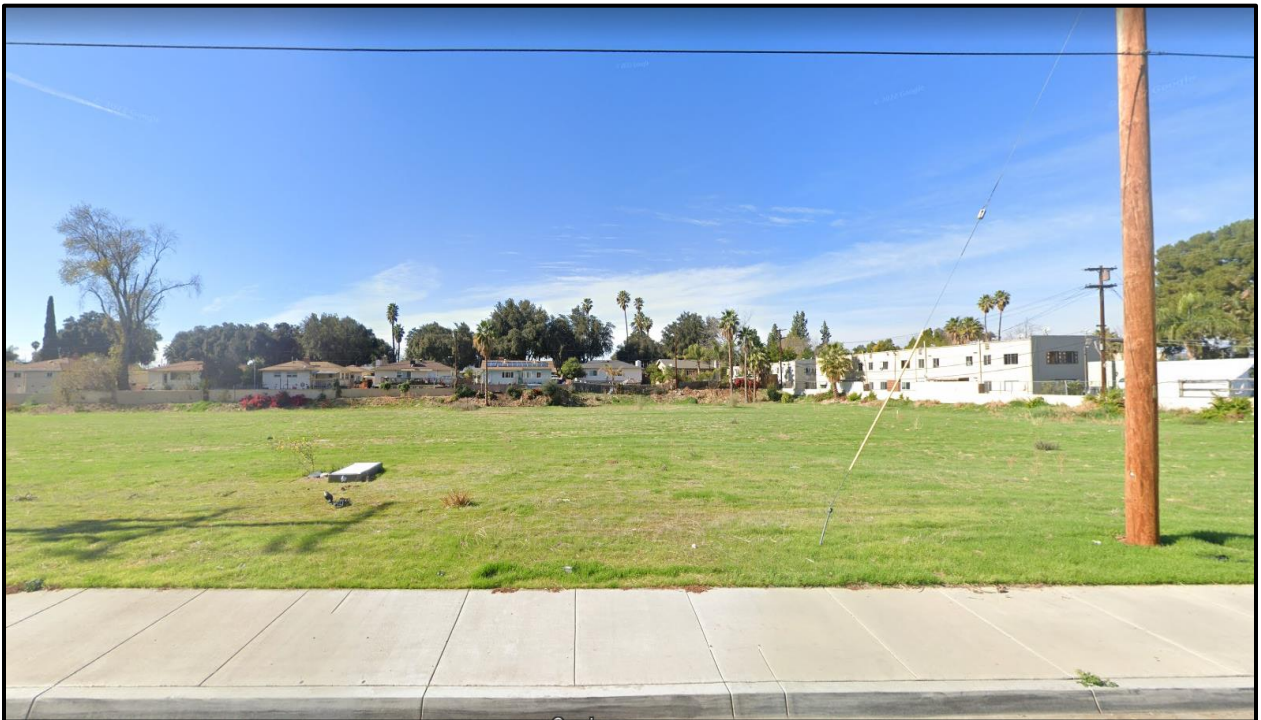
Easterly view of project site