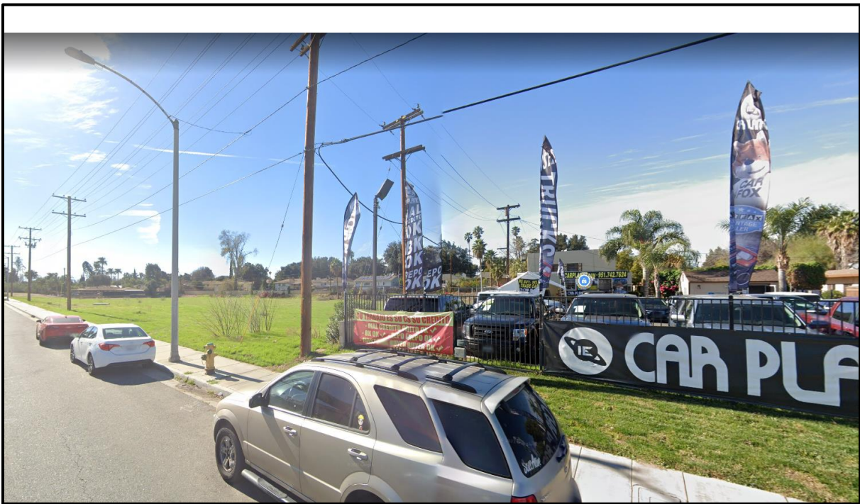
Northerly end of project site, adjacent to existing car dealership