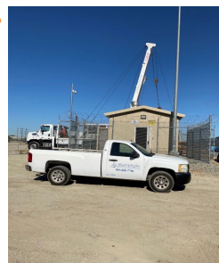
Garner Well C in relation to our service area.