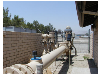
Photo shows existing pump & motor assembly