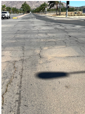
MARTIN LUTHER KING BLVD.