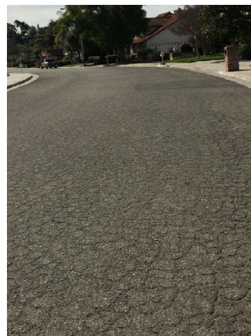
DE GRAZIA ROAD