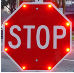
EDGE LIT STOP SIGN