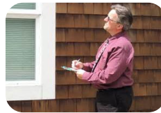
Property Mgt. 1