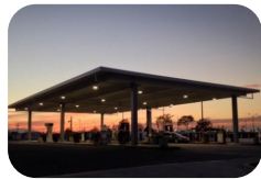
Fleet Mgt. 42