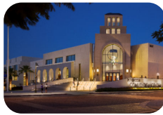
Capital Projects 2