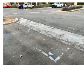
Parking Lot Surfacing