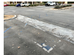
Parking Lot Surfacing