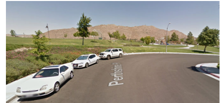
Google Street view of Perthshire Place