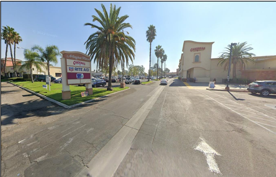
Northerly Entrance from Arlington Avenue