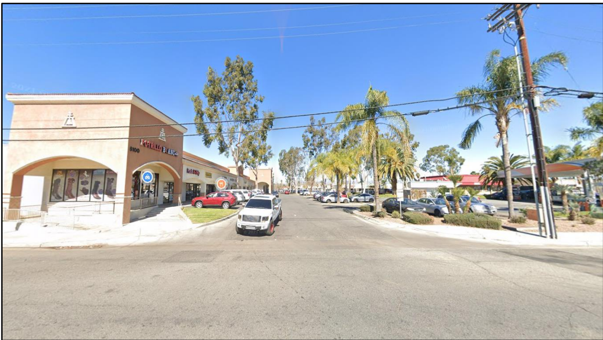
Southerly view from Cypress Avenue