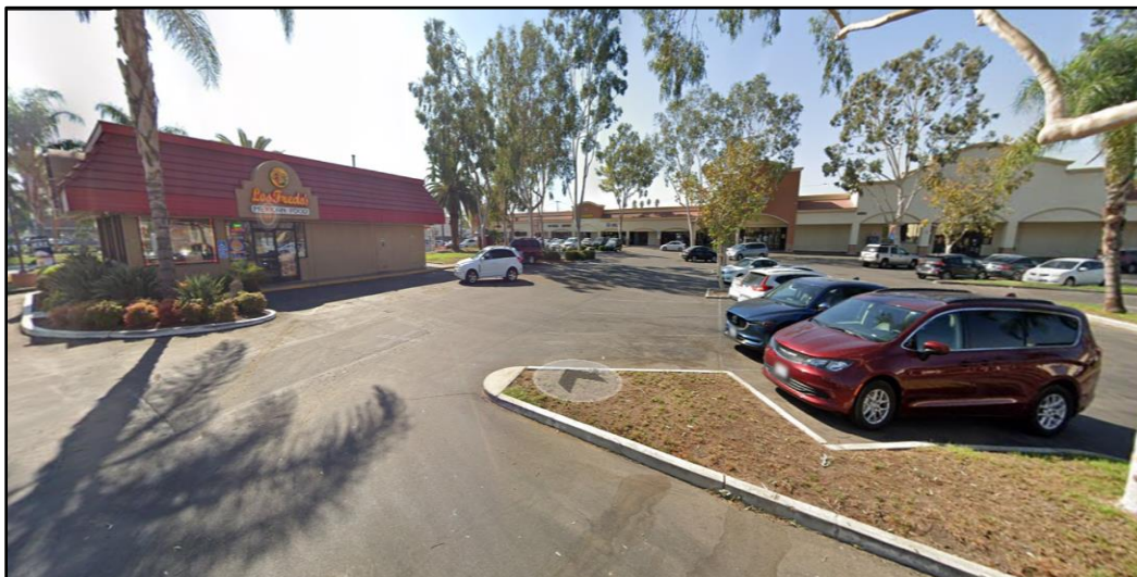
View of Parcel 2 and 3, showing existing restaurant to be demolished