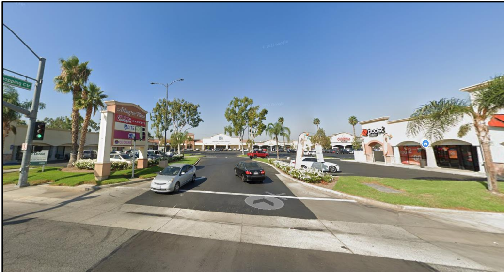
Easterly entrance from Van Buren Boulevard