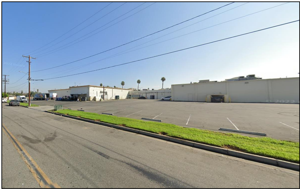
Westerly view from Harold Street