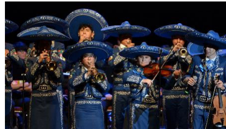
Riverside Arts Academy