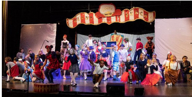
Riverside Children's Theater