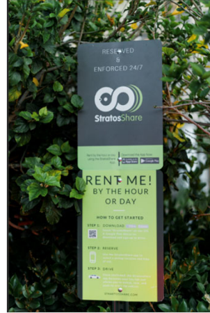
Existing location Signs