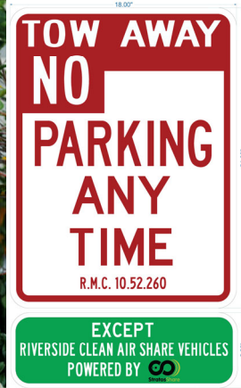
Proposed Signs (Initial Draft)