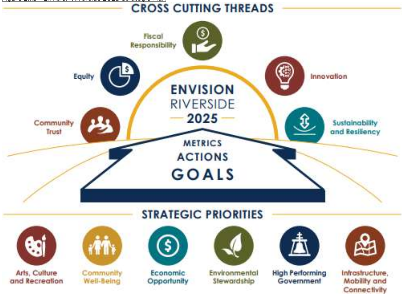
Figure 2.1.3 - Envision Riverside 2025 Strategic Plan

The City has identified five themes in its 2025 Strategic Plan that should be reflected across all of its outcomes: 1