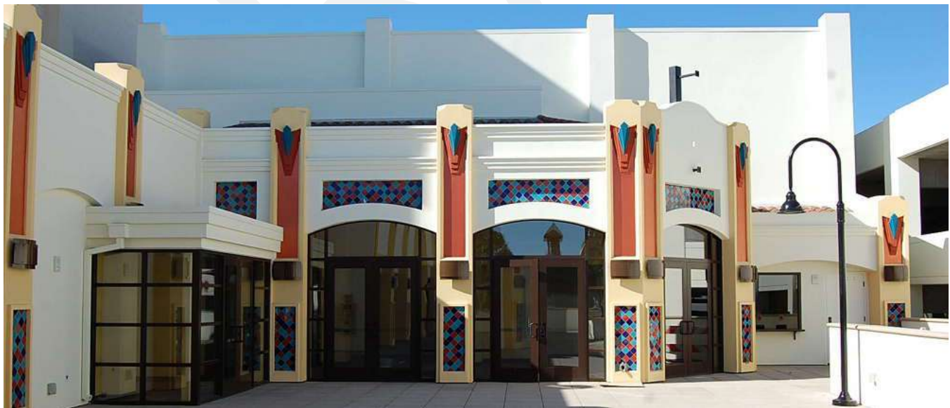
Figure 4.4.3 The Box Building Façade

The Box can seat 200-225 people. Amenities include black velour drapes, dressing room area, tech control booth, one ladder, lobby, box office, promenade, basic stage lighting system, standard house plot and a basic sound system.