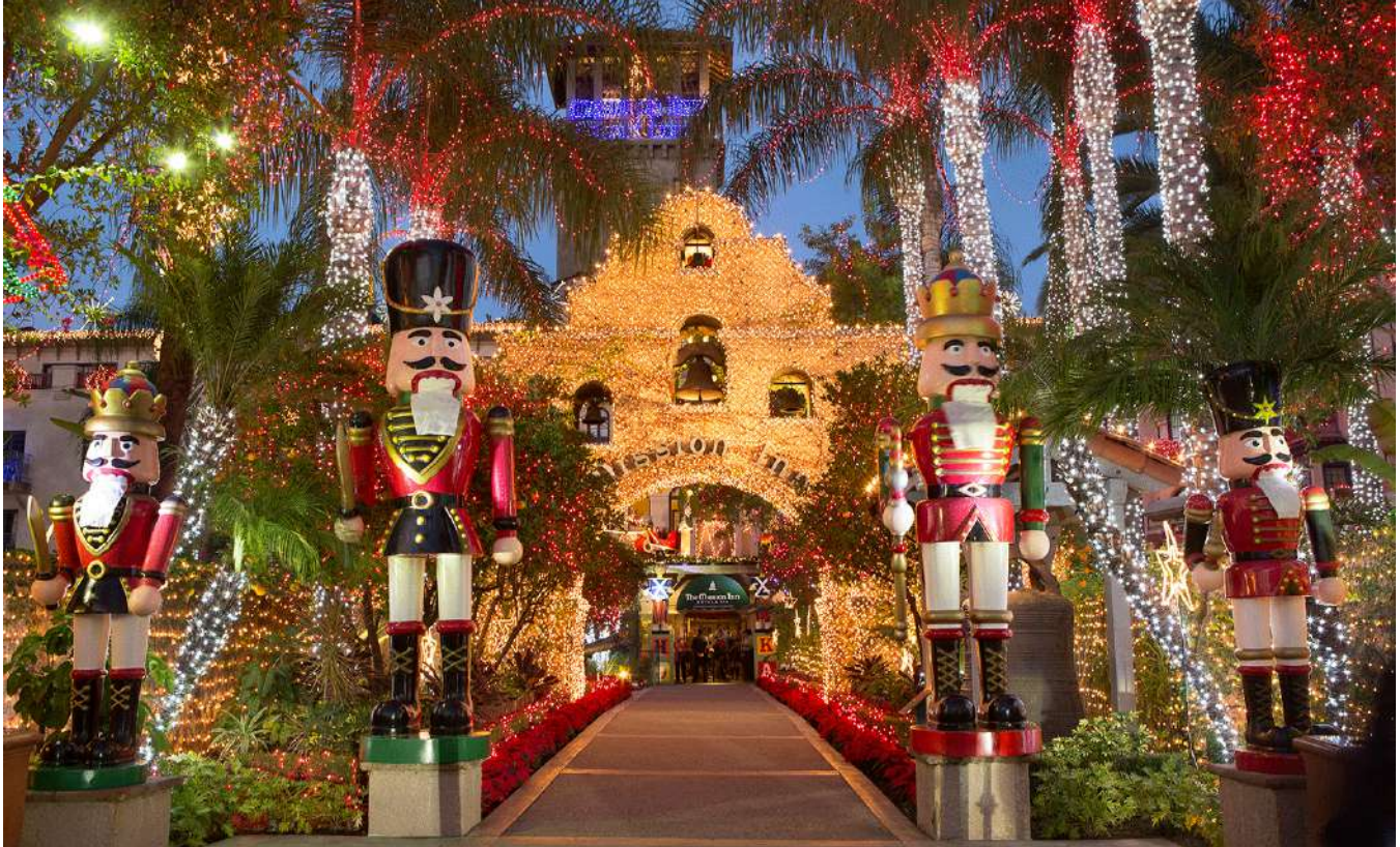
Figure 4.6.1 Festival of Lights

The Festival of Light has been a community event for 31 years. It is one of the nation's largest holiday lights collections, voted "Best Public Lights Display" by USA Today. The FOL has been a tradition since 1992 and over 500,000 people come to see the lights each year.