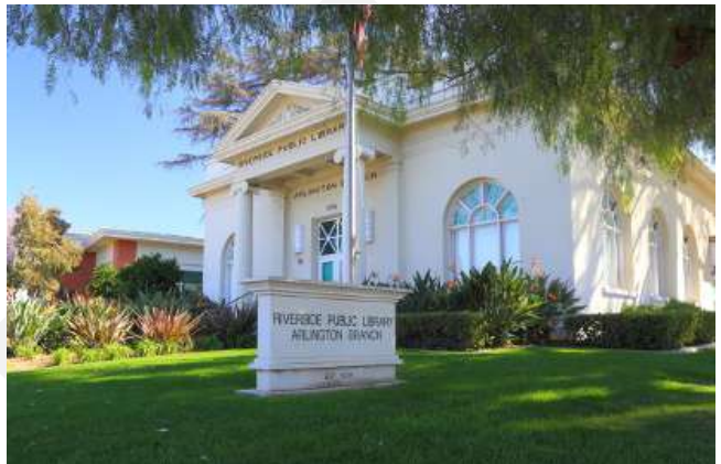
Figure 4.3.2 Arlington Library