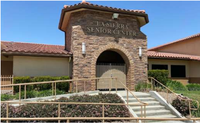
Figure 4.5.1 La Sierra Senior Center