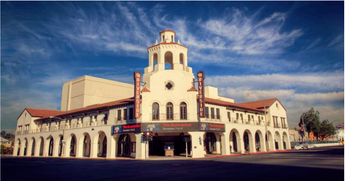
Figure 4.4.1 Fox Theater Building Façade

The Riverside Fox Theater was named after its founder William Fox and first opened in 1929. The Fix has a rich history and is a community staple in Riverside. The theater has a capacity of 1,550. The City of Riverside's Arts & Culture initiative put $35 million into the Fox's renovation and restoration which took place from 2004 to 2010.