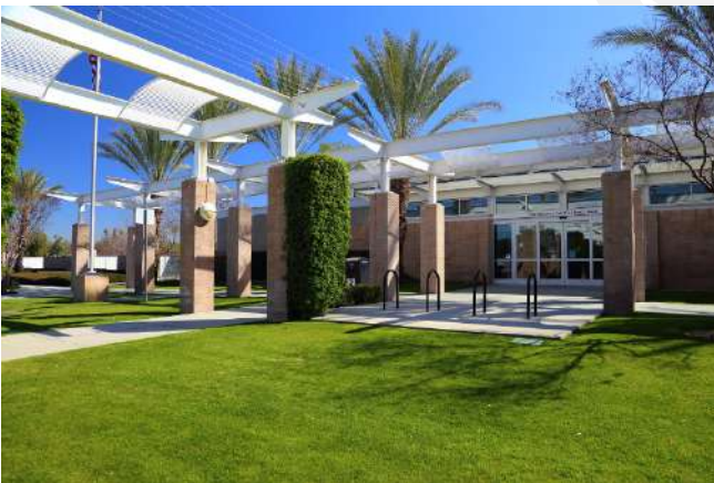
Figure 4.3.3 Casa Blanca Library