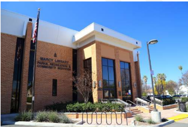
Figure 4.3.5 Marcy Library