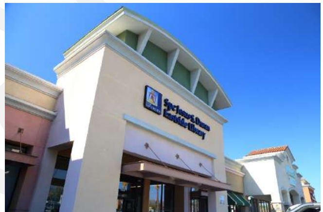
Figure 4.3.4 Eastside Library