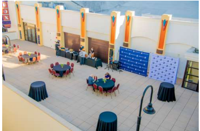
Figure 4.4.5 The Box Promenade