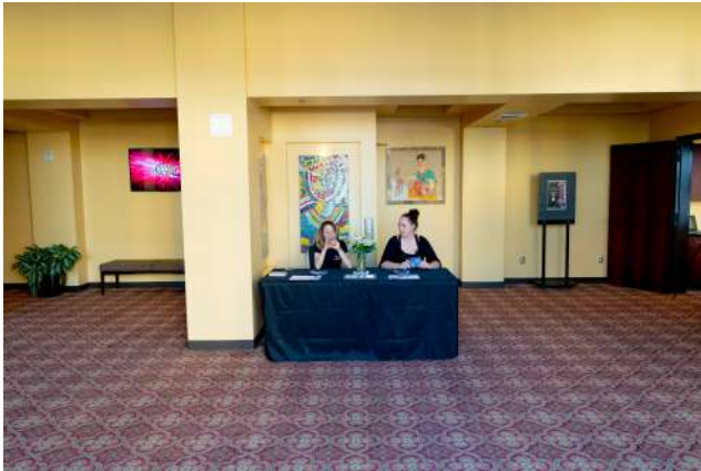
Figure 4.4.6 Lobby