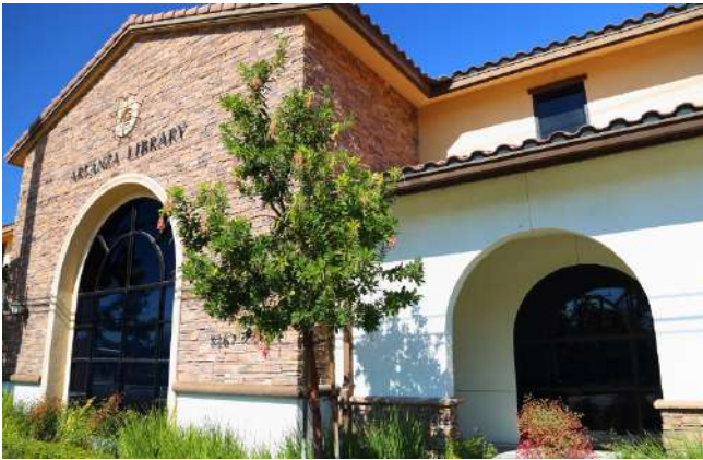
Figure 4.3.1 Arlanza Library