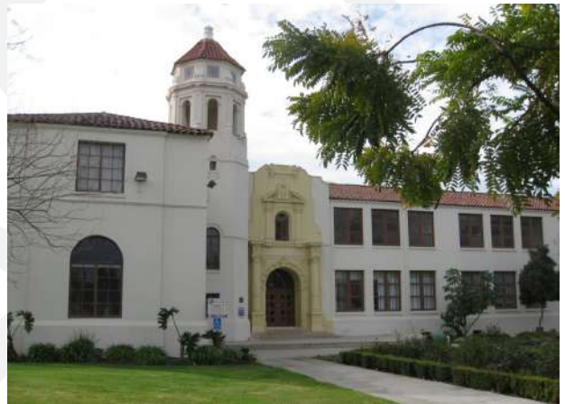
Figure 4.5.4 Cesar Chavez Community Center