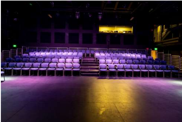
Figure 4.4.4 The Box Seating