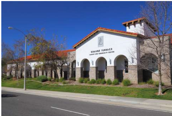
Figure 4.5.3 Orange Terrace Community Center