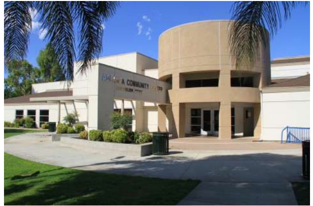
Figure 4.5.2 Arlanza Community Center/Bryant Park