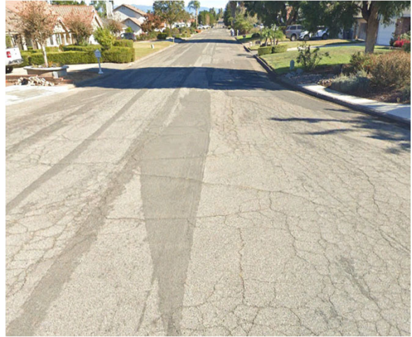
KAY JAY STREET