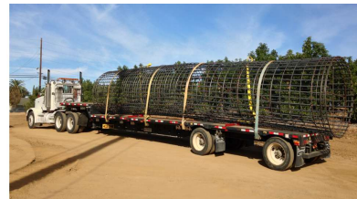
REBAR CAGE READY TO BE OFFLOADED AT JOB SITE