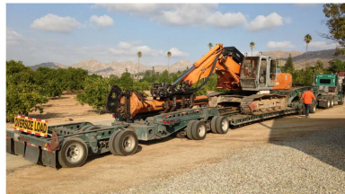
DRILL RIG ON TEN AXLE TRAILER