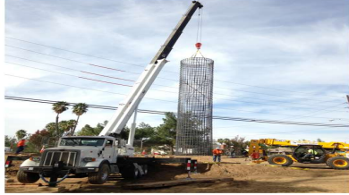
SETTING REBAR CAGE