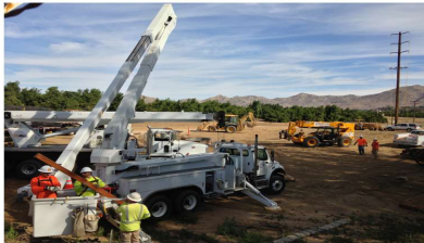
TYPICAL CONSTRUCTION EQUIPMENT