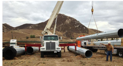
UNLOADING STEEL POLES