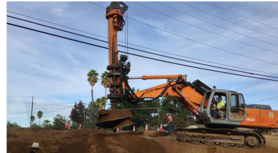
DRILL RIG AT WORK