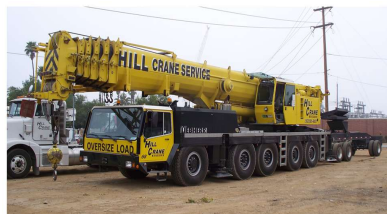
CRANE USED TO SET STEEL POLES