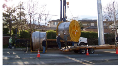
OFFLOADING CABLE REEL AT JOB SITE