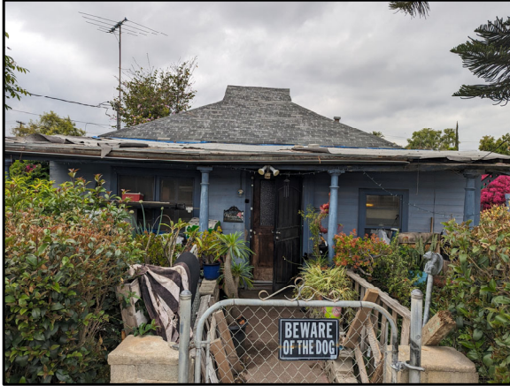
South (Front) Elevation and front yard