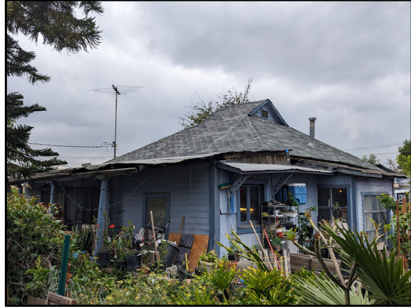
East (Side) Elevation