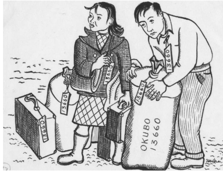
Citizen 13660 ID number by Miné Okubo