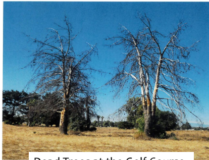
Dead Trees at the Golf Course