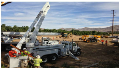
TYPICAL CONSTRUCTION EQUIPMENT