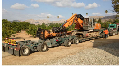
DRILL RIG ON TEN AXLE TRAILER