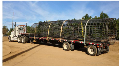
REBAR CAGE READY TO BE OFFLOADED AT JOB SITE