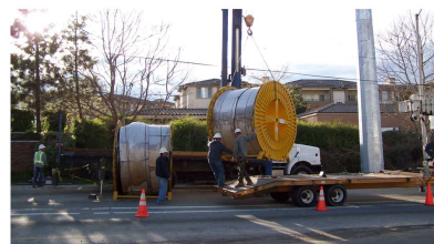
OFFLOADING CABLE REEL AT JOB SITE