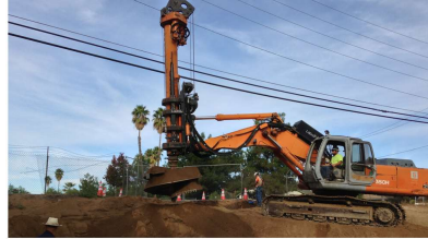
DRILL RIG AT WORK