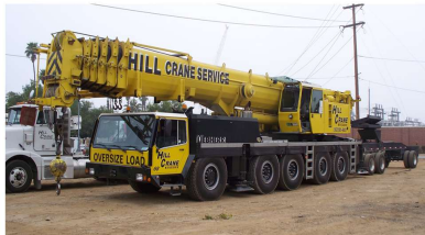
CRANE USED TO SET STEEL POLES