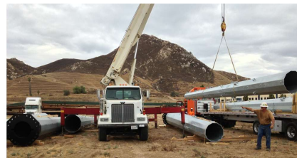
UNLOADING STEEL POLES