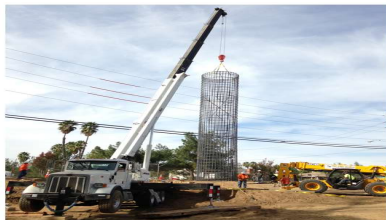
SETTING REBAR CAGE