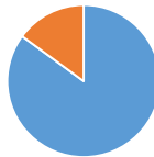
Waste Type Received

Septage Waste (85%) Commercial Waste (15%)