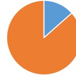
Load Origination - Septage Waste

Septage Waste: City (13.5%) Septage Waste: non-City (86.5%)