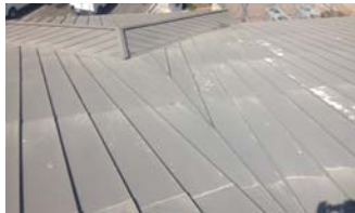
La Sierra Roof