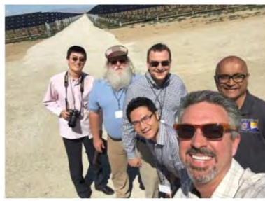
The RPU Tour Group