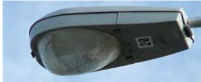
Old High Pressure Sodium Fixture (HPS)