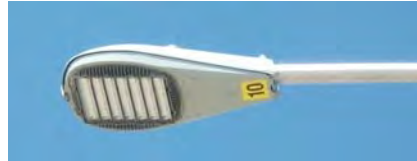
New Light Emitting Diode Fixture (LED)