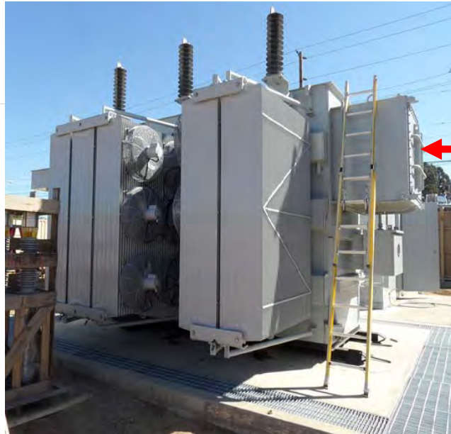
Typical New Load Tap Changer