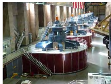
8 of the 17 hydroelectric generators at the Hoover Plant