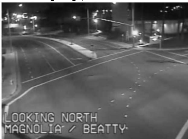
Old HPS Lighting (from surveillance camera)