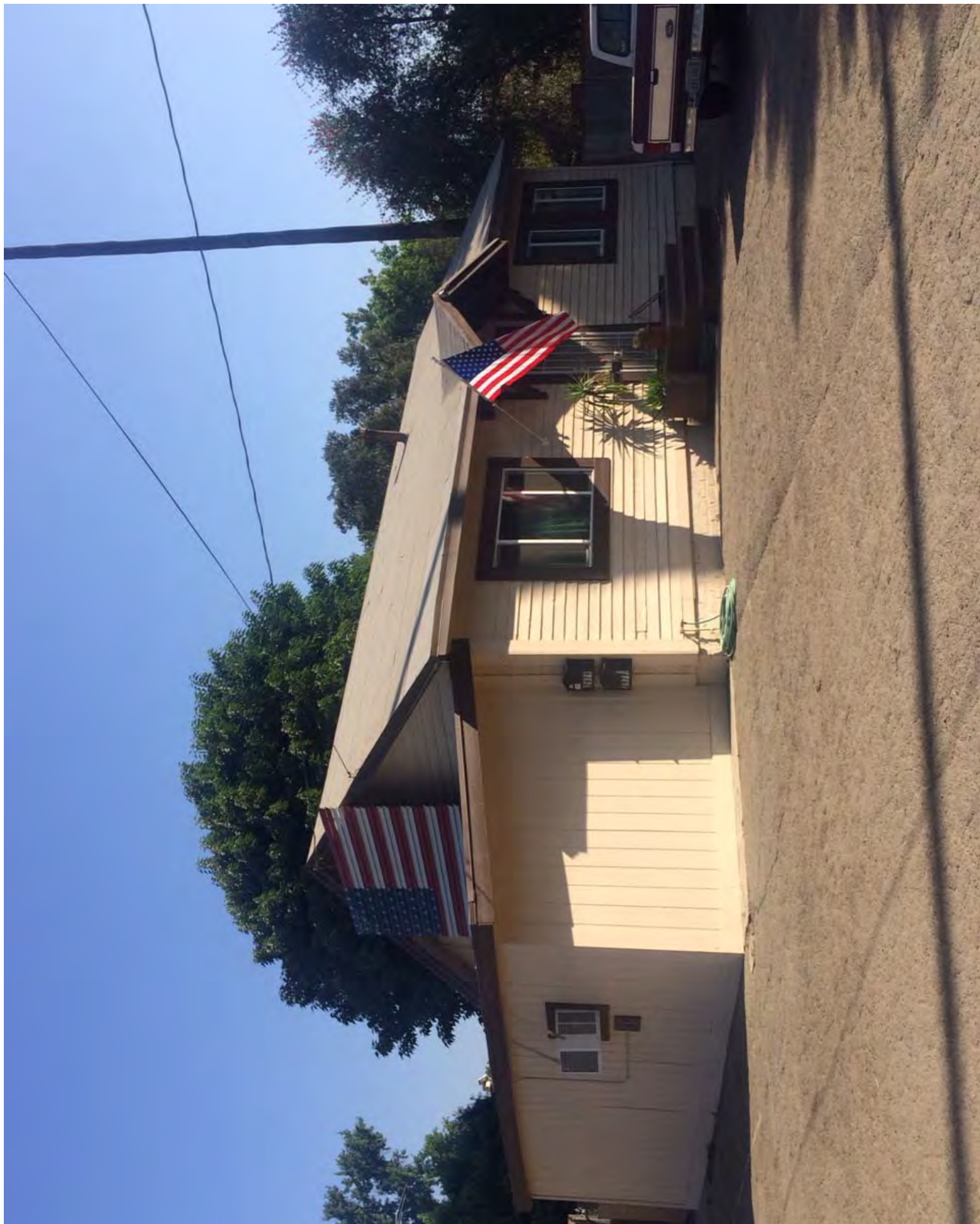
Exhibit 5 - P16-0383, Photos