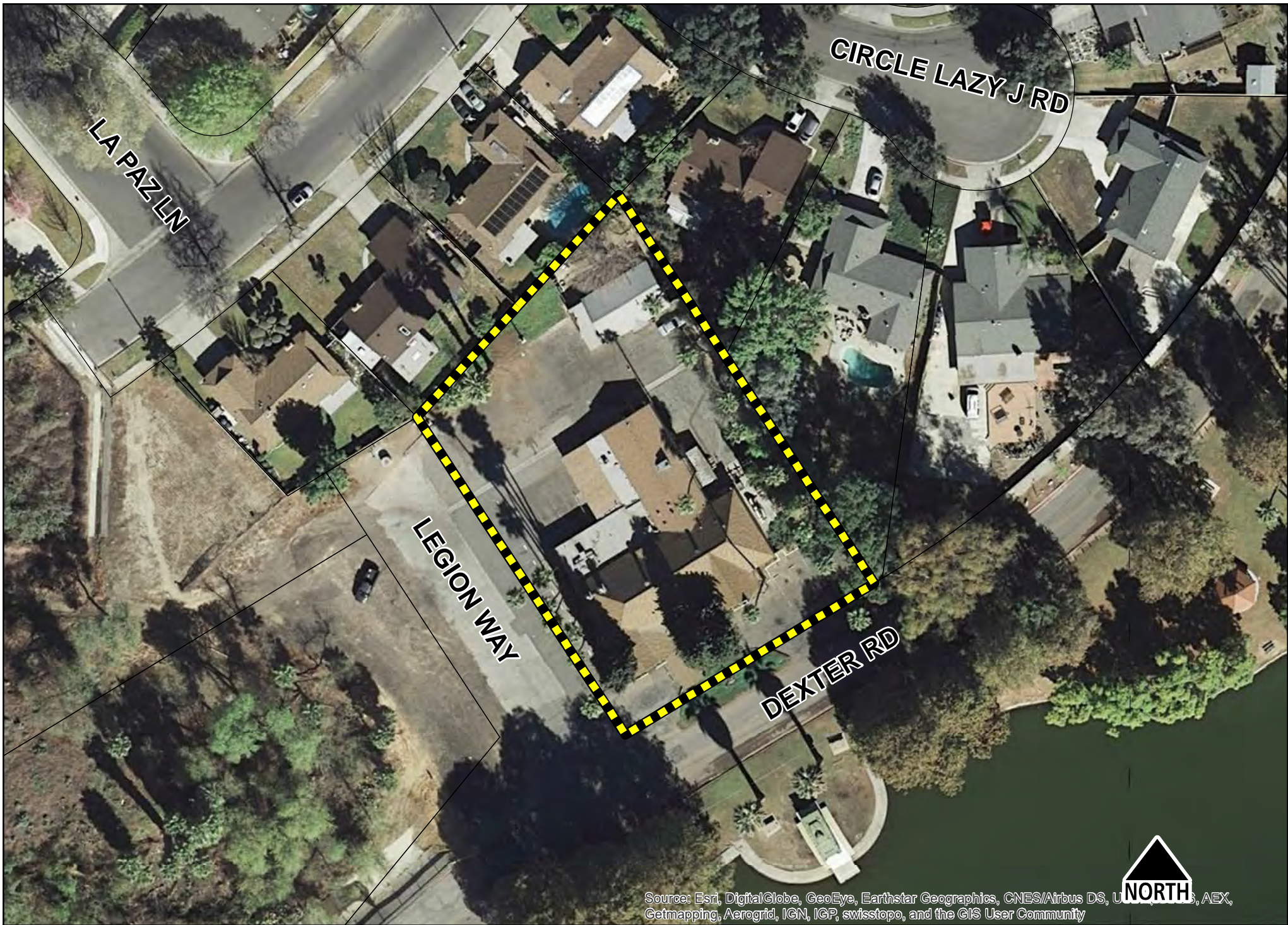
Exhibit 1 - P16-0383, Aerial