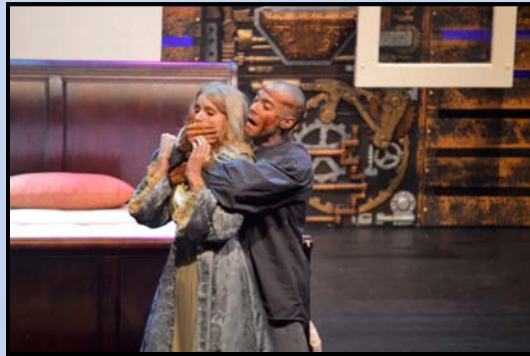
Creature Design Frankenstein