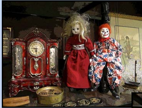
The Curiosity Shop Riverside's Own 5 Star Escape Room