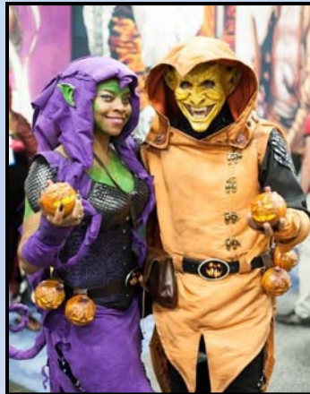
Comic-Con Grand Prize for Cosplay from Marvel Universe