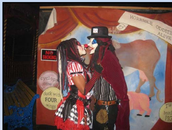
Maze and Costume Design Castle Park Entertainment