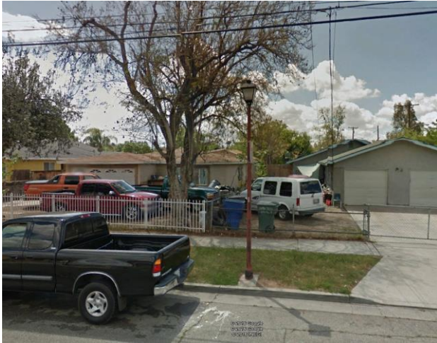
Streetlight in need of repainting