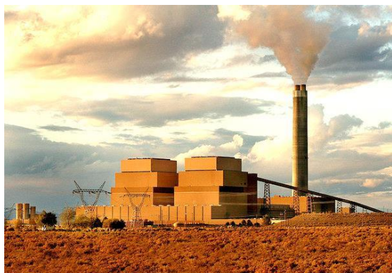
IPP Coal Plant

IPP Repower Project: The Repower Project's default design is a natural gas fueled combined cycle plant with two power blocks, each with a design capacity of approximately 600 MW for a total of 1,200 MW maximum generating capacity. The generation configuration and technology may be modified with 80% vote by Repower Project participants.