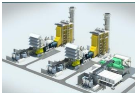
Natural Gas Plant

Prior City Council and Board Action: On June 16, 2015, and May 15, 2015, respectively Riverside City Council and Board of Public Utilities (Board) approved the Second Amendatory Power Sales Contract (2APSC) and authorized Riverside's participation for up to 5% or 60 MW ( Attachment 2 ). On March 16, 2016, with the governing body approval of all 36 current participants, the 2APSC became effective, allowing commencement of the renewal process. On March 18, 2016, IPA issued the Renewal Offer to Riverside. Prior to participating in the Repower Project, Riverside must obtain all required regulatory contract approvals. IPA has opined that this includes the SB 1368 Compliance Filing requirement.