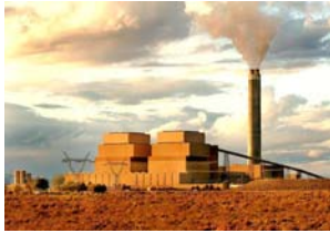
IPP Coal Plant (Approx. 2,000lbs CO 2 /MWh)