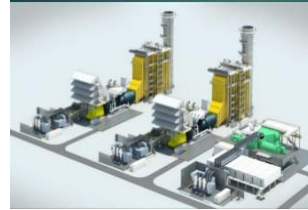
Natural Gas Plant (Proposed: Approx. 800lbs CO 2 /MWh)