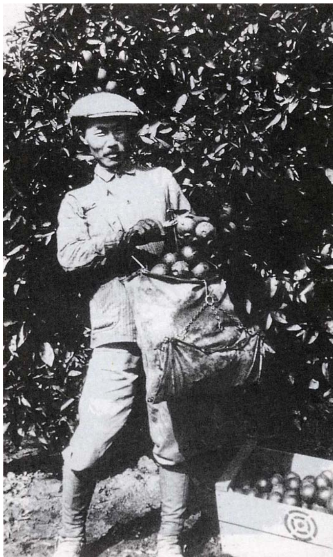
Ahn Chang Ho in Riverside Orchard