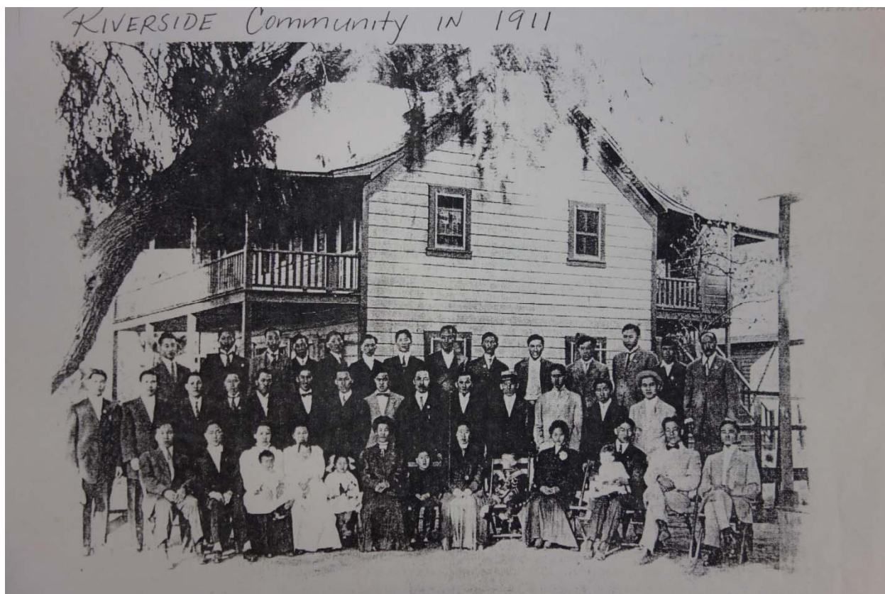
Pachappa's Community Gathered for the 1911 KNA Conference.