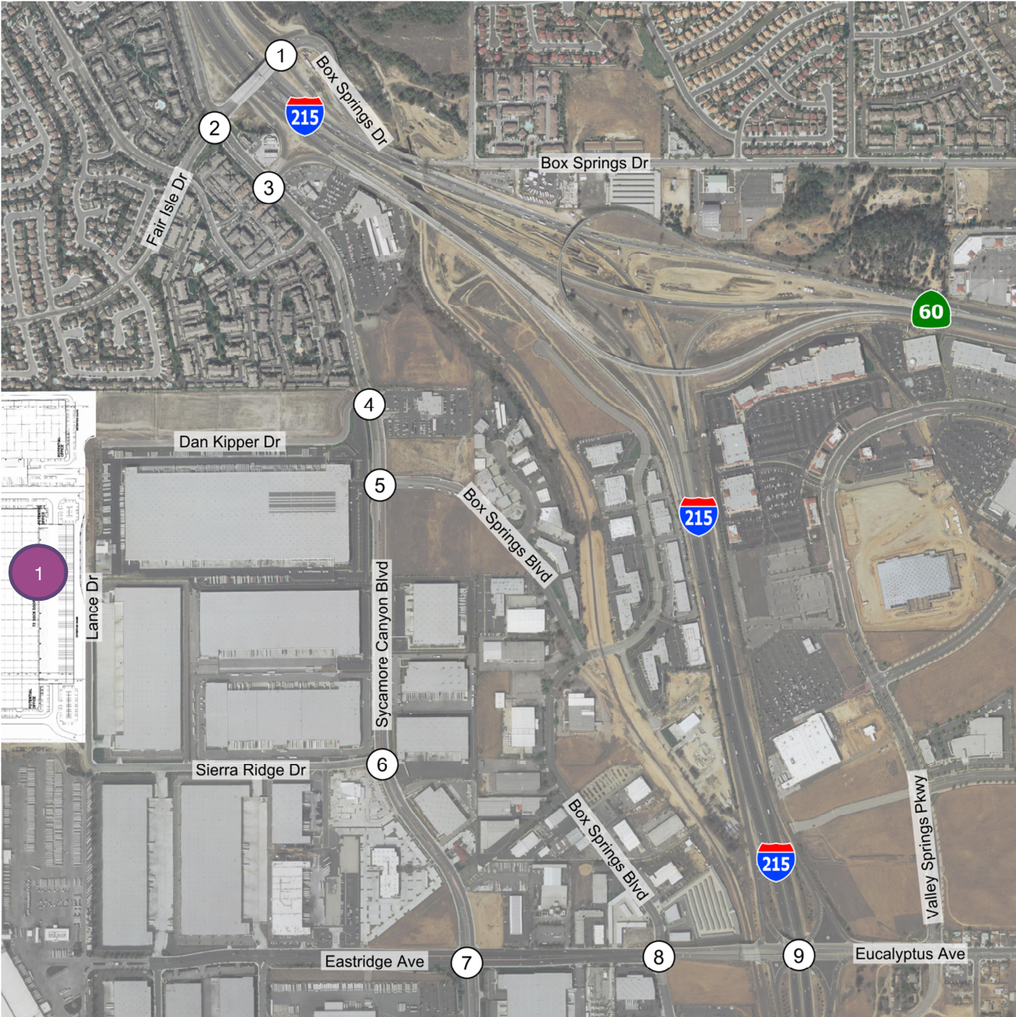
Figure 2-A – Project Site Location Map