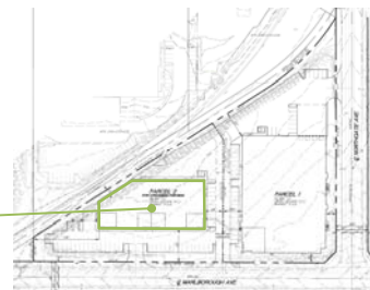
Building 2 – 975 Marlborough Avenue 20,416 Square Feet