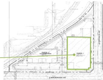
Building 1 – 925 Marlborough Avenue 42,629 Square Feet