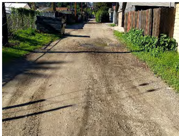
ALLEY – MISSION INN BL