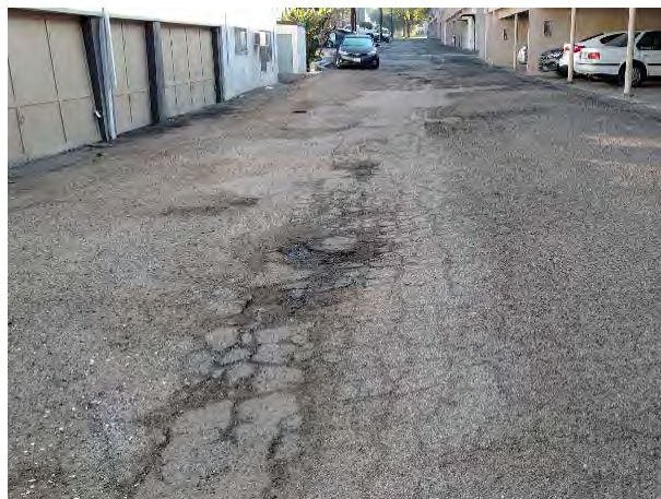
ALLEY – RUSTIN AV