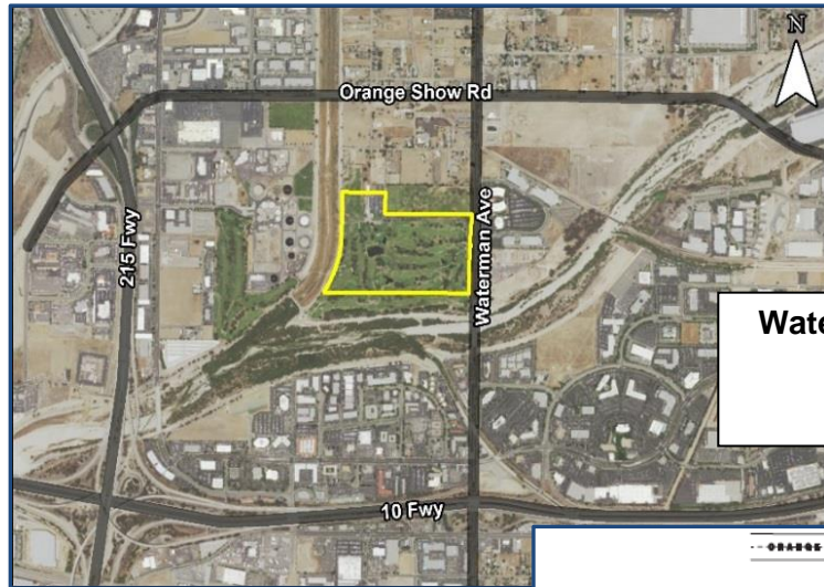
Waterman Golf Course Location Map and Conceptual Development Plan