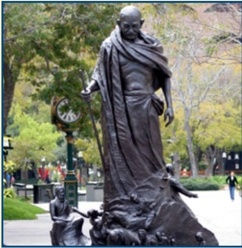
Mahatma Gandhi Memorial Statue