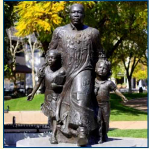
Martin Luther King Memorial Statue