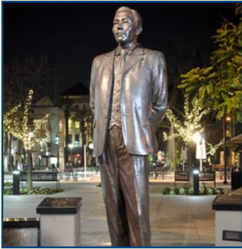
Ahn Chang-ho Memorial Statue