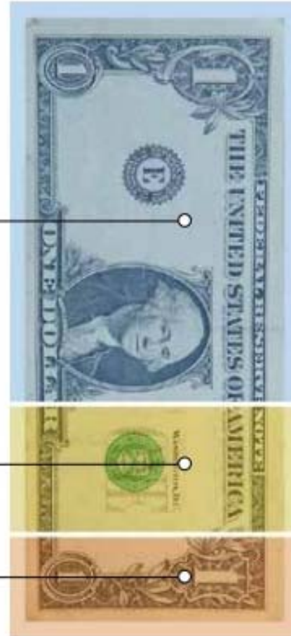
Source: CalPERS Income over the last 20 years as of June 2016

Unfunded Actuarial Liabilities must be paid over 30 years