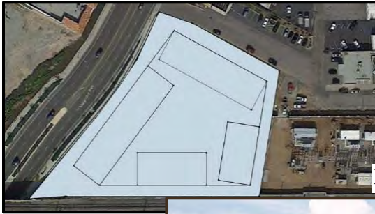
Hallmark @ Magnolia Apartments