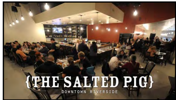
Justice Center District Restaurant Example