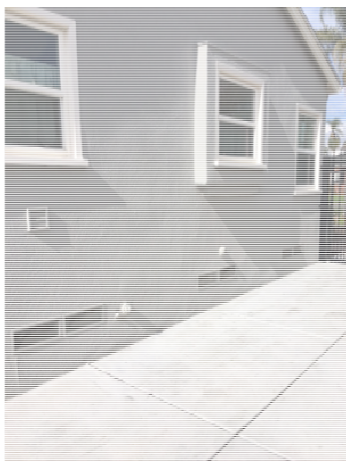
East Elevation Windows