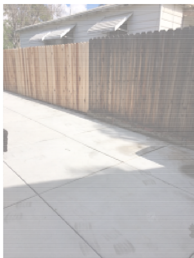
View Looking Northeast