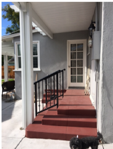
Rear Patio Handrails