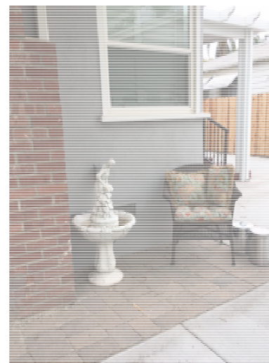
West Elevation Windows