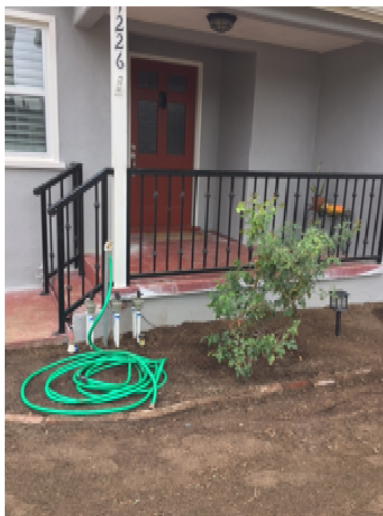
Front Porch Balustrade