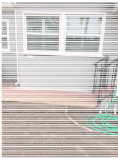
North Elevation Windows