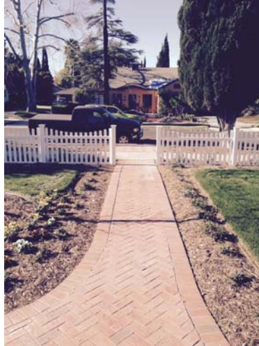
View From Residence, Looking South