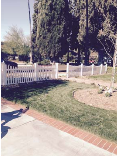
View Looking Southwest