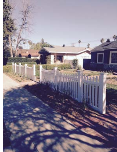
View looking Northwest