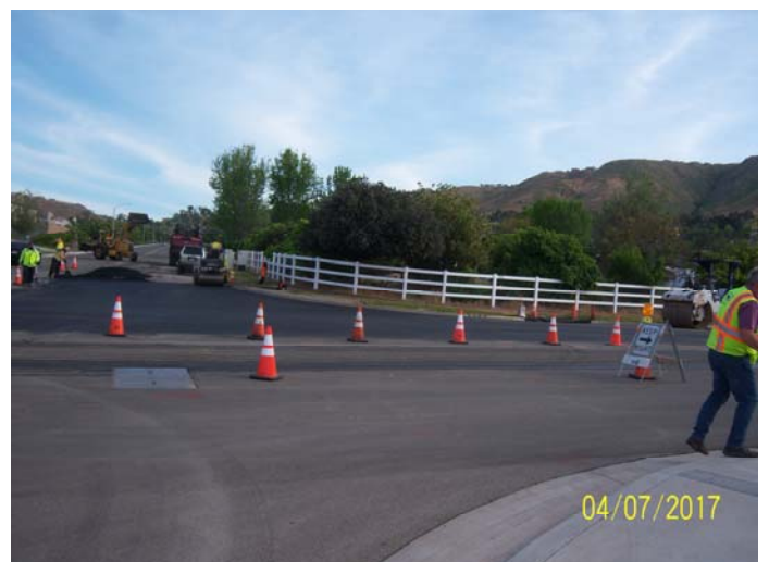
Figure 5 - Final pavement on Victoria Ave