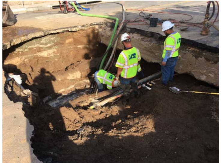
Figure 2 - Repairing the pipe