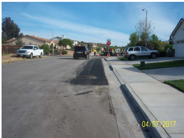
Figure 4 – Final pavement on Lyon Ave