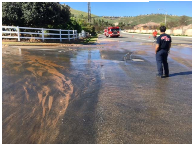
Figure 6 - Water flowing from leak