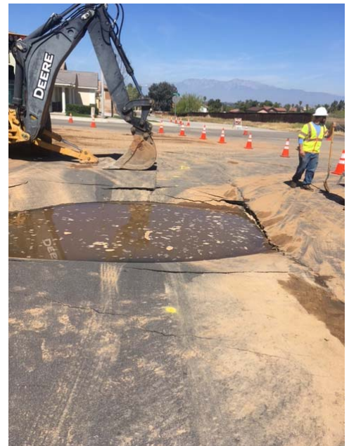
Figure 3 - Assessing the damage