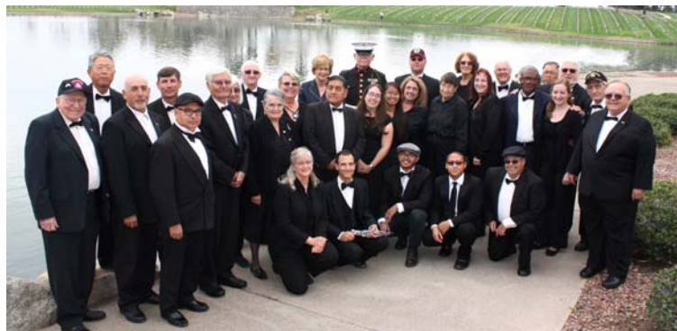
Riverside Concert Band at the Riverside National Cemetery

Rehearsals are held at the Evergreen Masonic Lodge 5801 Chicago Avenue on Tuesday evenings 6:15 to 7:15 p.m. - Swing Ensemble 7:30 to 9:15 p.m. - Concert Band