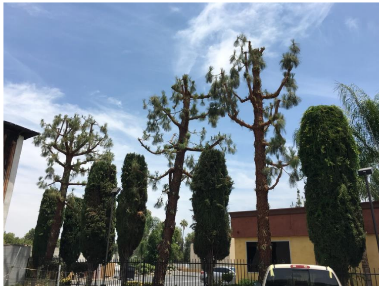
Topped and over pruned pines at a business on Hole Ave.