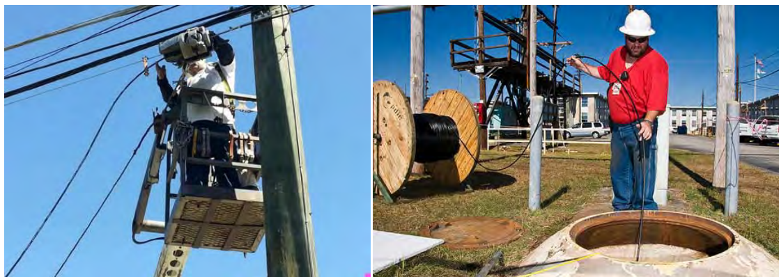
Overhead and Underground Installation