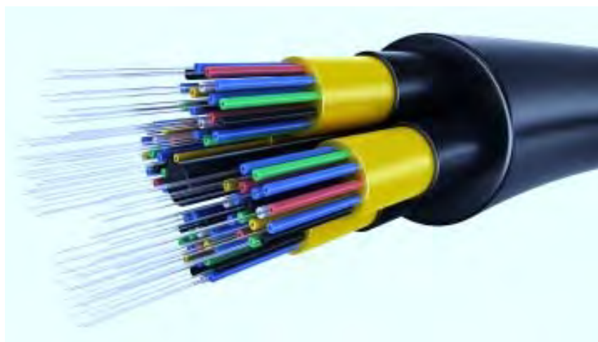
Fiber Optic Cable