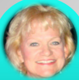
EMPLOYEE OF THE YEAR