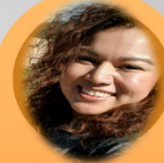
DIRECTOR'S CHALLENGE AWARD