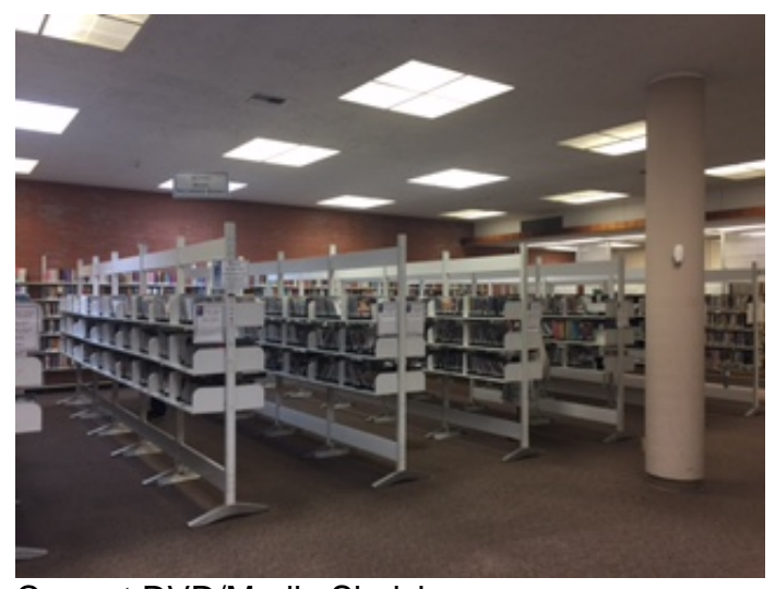
Current DVD/Media Shelving