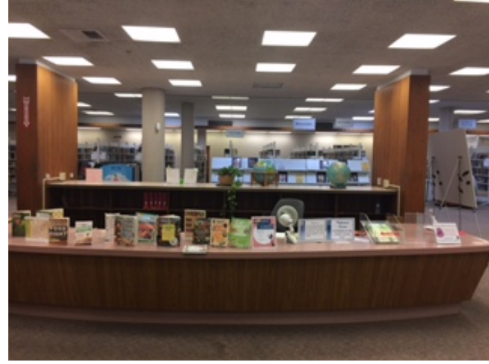
Current Reference Desk