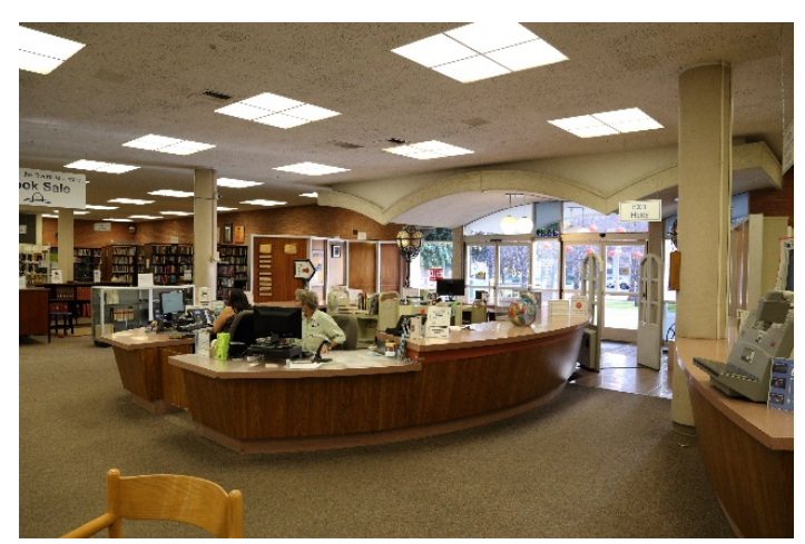
Current Customer Service Desk

The existing Main Library is 60,000 square feet. The new Main Library will offer approximately 35,000 square feet, with far more usable and flexible square footage than the existing library. This is accomplished in efficiencies gained through advancements in technology, a more flexible, functional building program and an improved service model. Examples include: