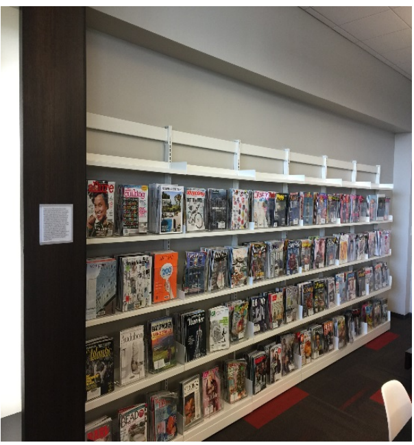
Proposed Magazine Wall Mount