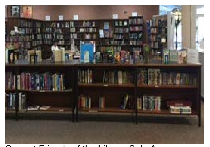
Current Friends of the Library Sale Area