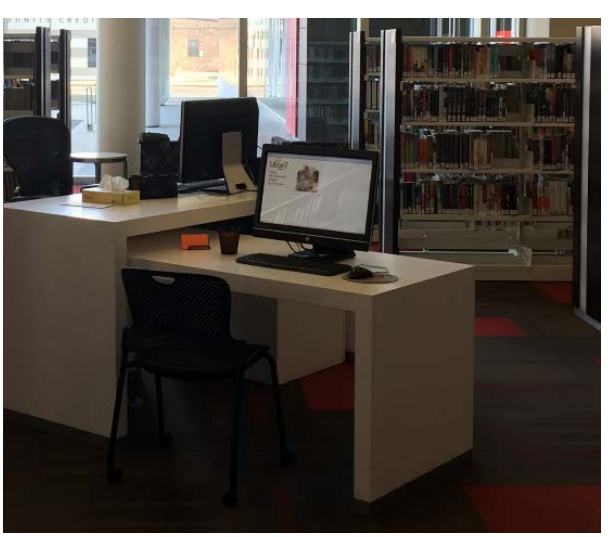
Proposed Staff Assistance Point