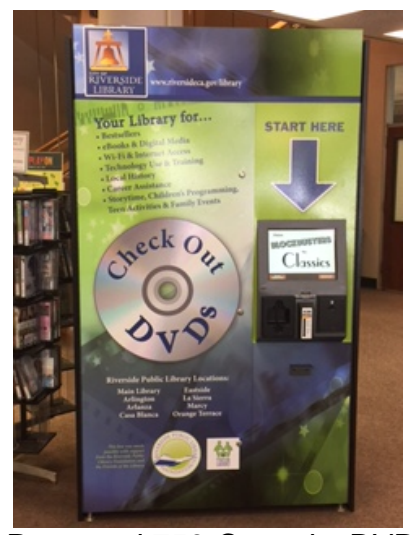
Proposed 750-Capacity DVD Unit