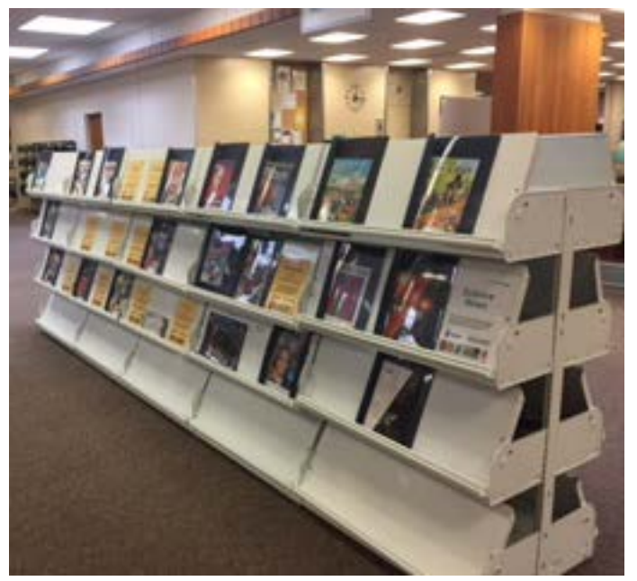
Current Magazine Shelving